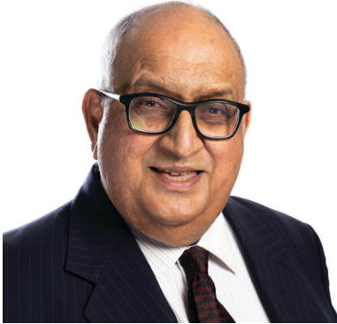
Rt Hon Sir Anand Satyanand GNZM QSO KStJ Chancellor University of Waikato

It is a privilege to share this very important day with you, our students, who have worked so hard to reach this culmination point. Graduation is the perfect time to reflect, celebrate and dream.