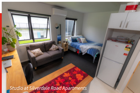
Studio at Silverdale Road Apartments

Accommodation applications open 1 August Most School Leaver scholarships close 31 August Accommodation applications close 30 September StudyLink applications close mid-December